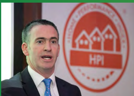
Damien English T.D. opening Better Homes 2018