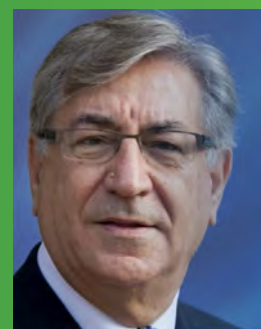
Commissioner Karmenu Vella, European Patron of World Green Building Week 2018