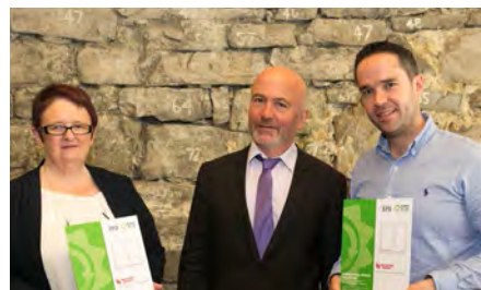
Munster Joinery and Quinn Building Products, 2 of the first 4 Irish product manufacturers to produce EPDs under the EPD Ireland programme.