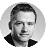
Niall Crosson Ecological Building Systems