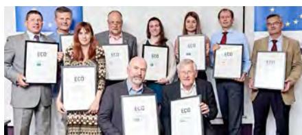
ECO Platform awards Established status to IGBC's EPD Ireland programme, with the right to carry ECO Platform Logo