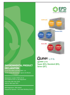
1st 12 EPDs produced under EPD Ireland