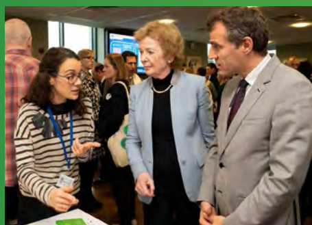
Presenting the Home Performance Index to President Mary Robinson