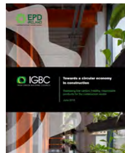
A comprehensive "Towards a circular economy in construction - Assessing low carbon, healthy, responsible products for the construction sector" report published.