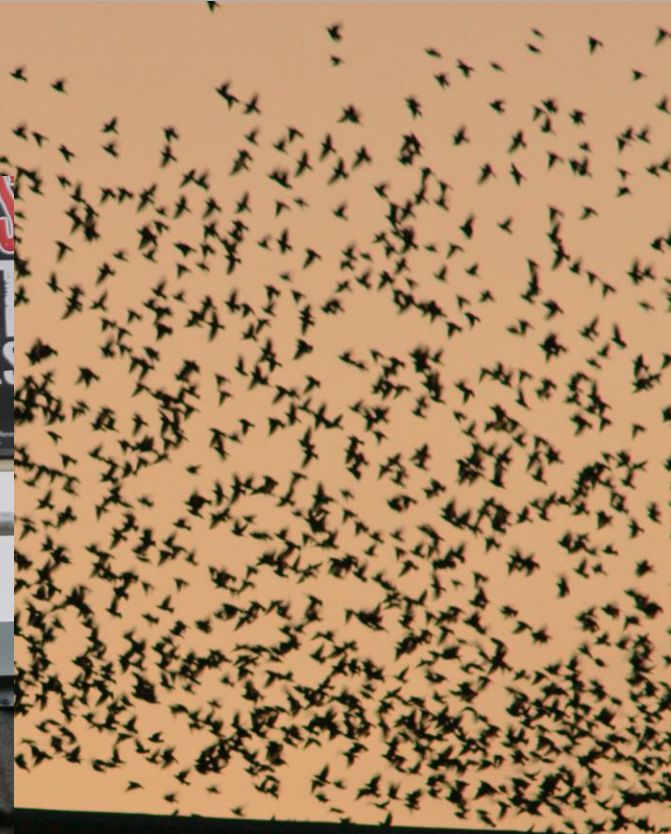
Crossing the Line